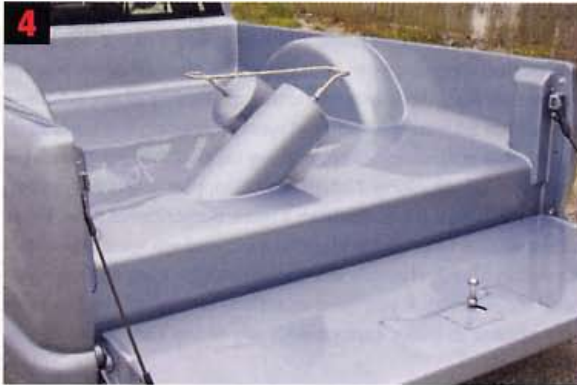
4. Rico Rodriguez's S-10 features a full-sheetmetal bed with a raised floor that showcases the air tanks and polished stainless line.