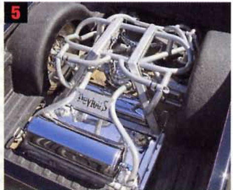
5. For you diehard mini-truckers out there, we feel your pain after fabricating the amazing jungle gyms that are custom back-halves. That's why we agree you should show them off. This truck owner built his suspension around the bed or the other way around. Either way, it turned out very nice.